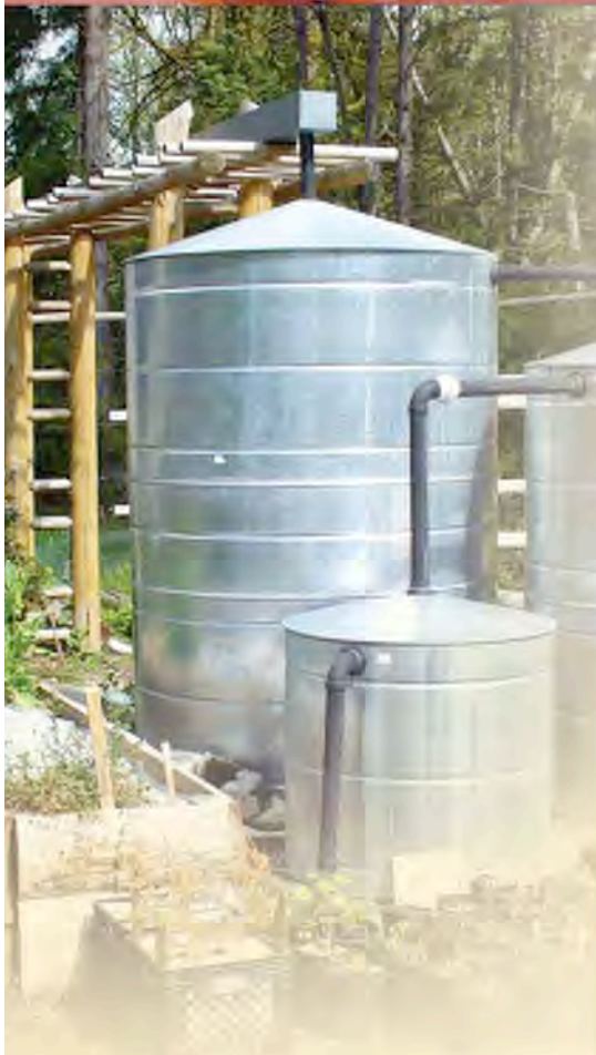
Larger systems can be used to harvest rain from apartment or commercial buildings.

A movement is underway. Public gardens are building on their plant and ecological heritage to become leaders in sustainability. For centuries public gardens have served as horticultural reserves and provided restorative experiences to their visitors. Today many gardens are also committed to promoting environmentally responsible behavior.